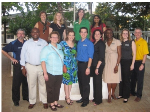
CIS University Visitors